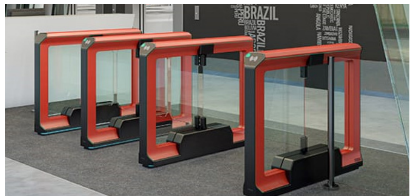
EZ Lane SL1000 Color Options Available

Cabinet styles available in multiple colors to enhance the aesthetic appeal of any location. Choose optional logo etching of glass panels for unparalleled customization capabilities.