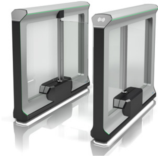
EZ Lane SL1000

(24" Standard opening up to 36" ADA opening)