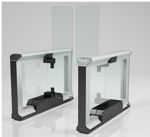
EZ Lane SL1000 High Glass Option 70"

The EZ Lane SL1000 is offered with swinging glass barriers in a variety of heights to appeal to varying levels of security requirements. The SL1000 also provides bi-directional access with passage openings of 1 second or less for high traffic installations. This turnstile uses optical beams to prevent tailgating and can be configured for ADA compliance.